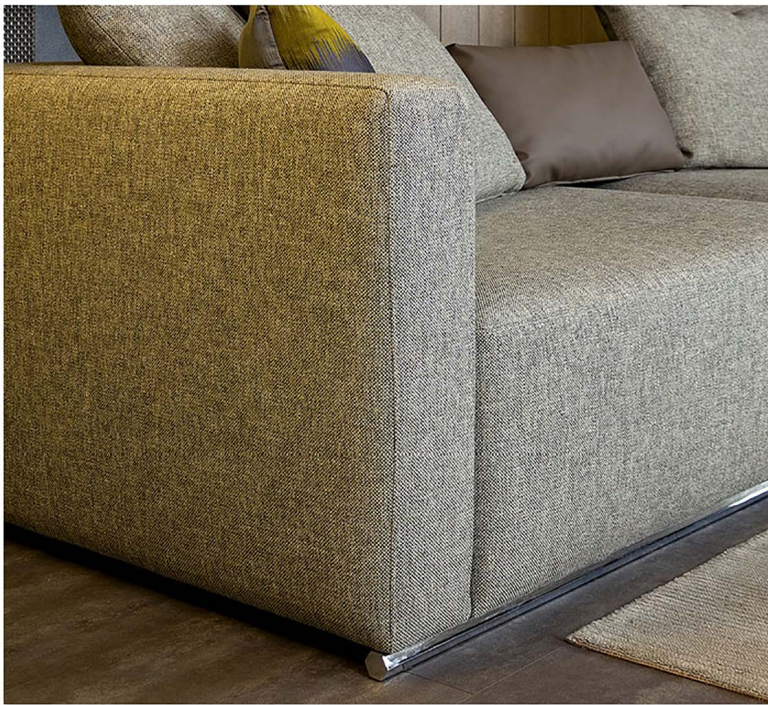
LUXURY SOFA SAGIST GROUP 16