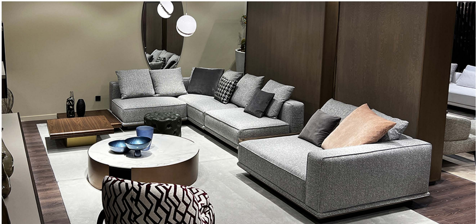
LUXURY SOFA SAGISTGROUP 01