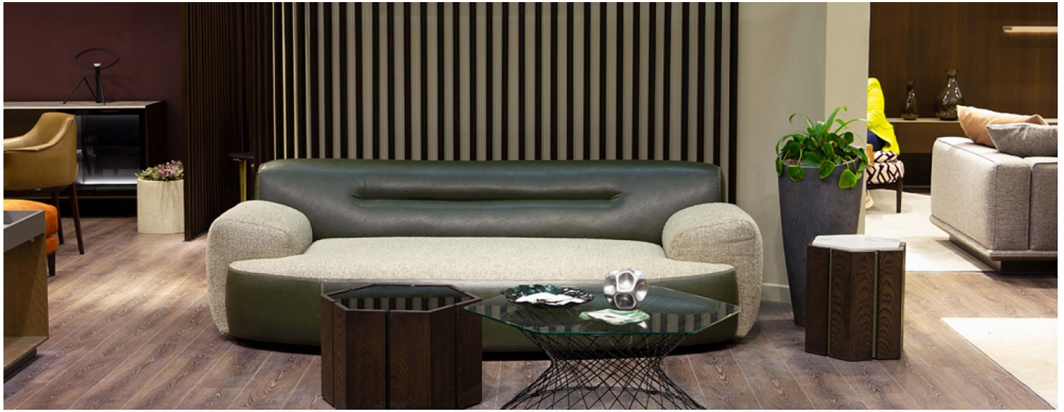
LUXURY SOFA SAGIST GROUP 08