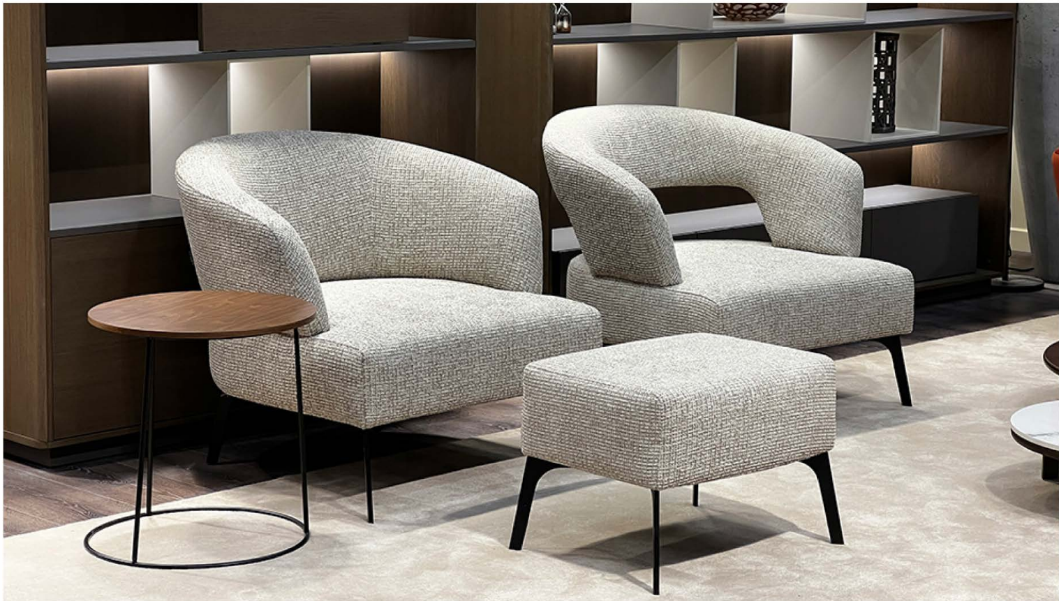
LUXURY SOFA SAGIST GROUP 18