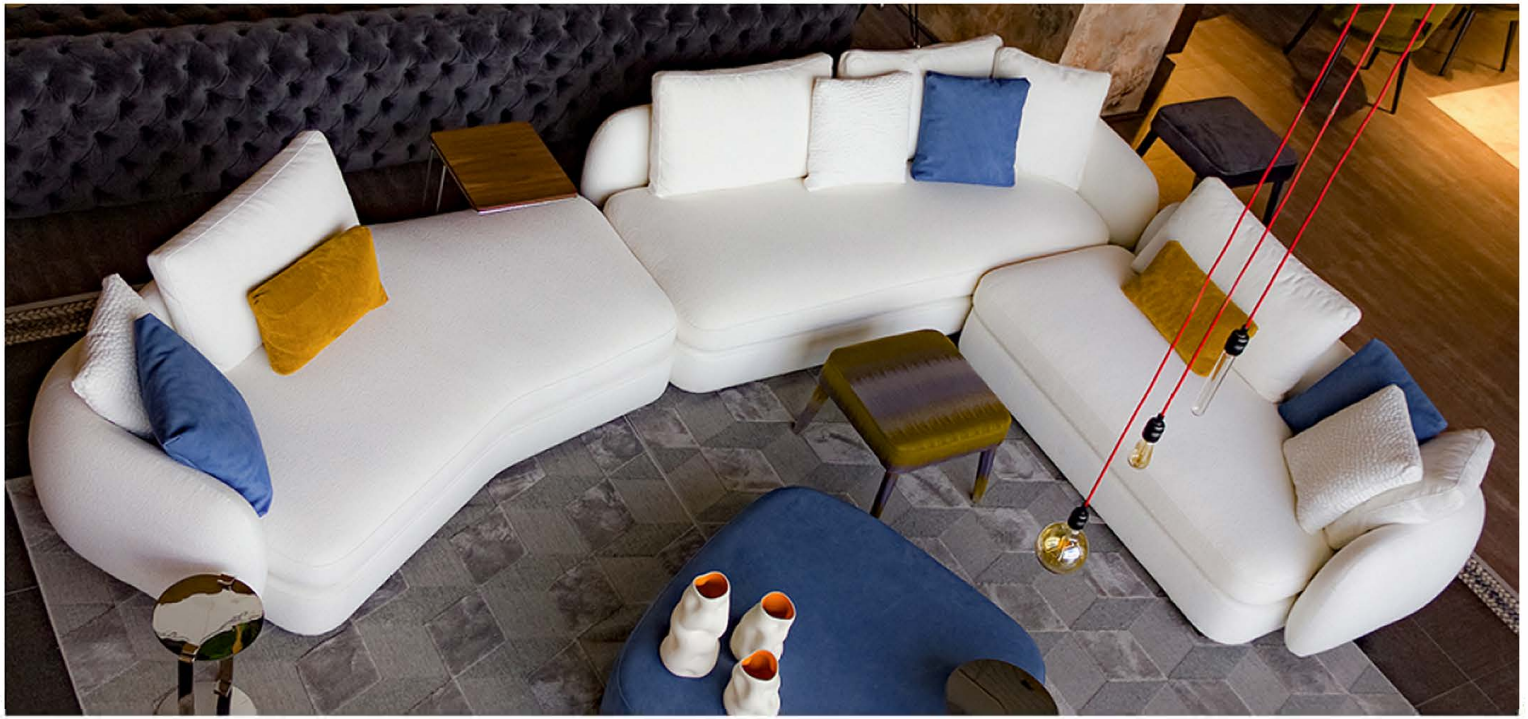
LUXURY SOFA SAGIST GROUP 03