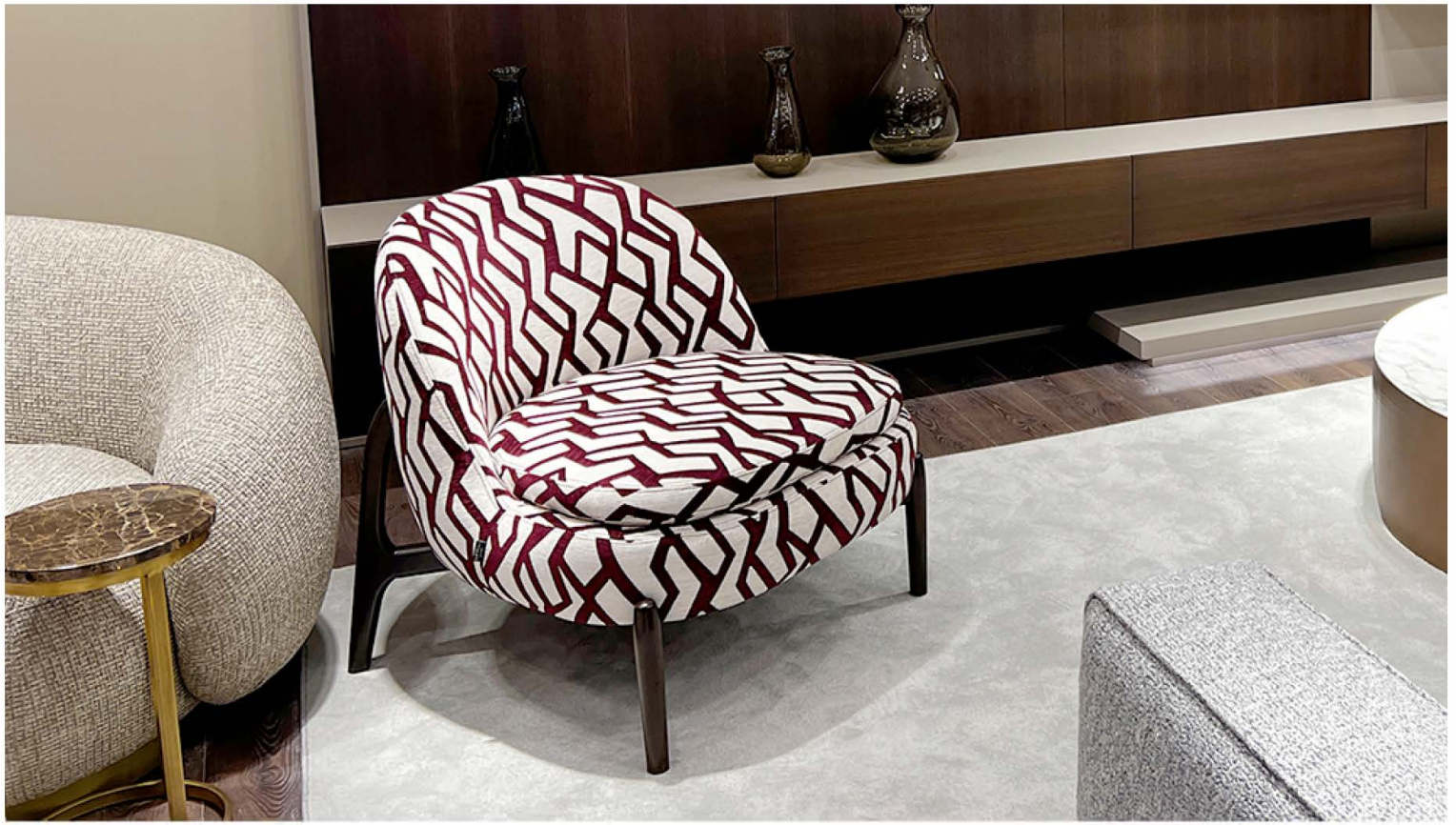
LUXURY SOFA SAGIST GROUP 19