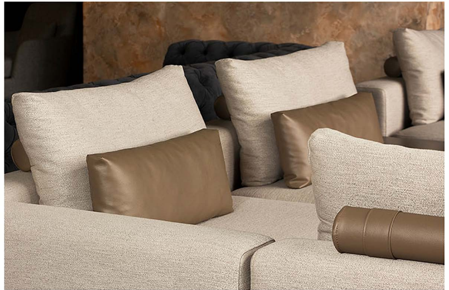
LUXURY SOFA SAGIST GROUP 06