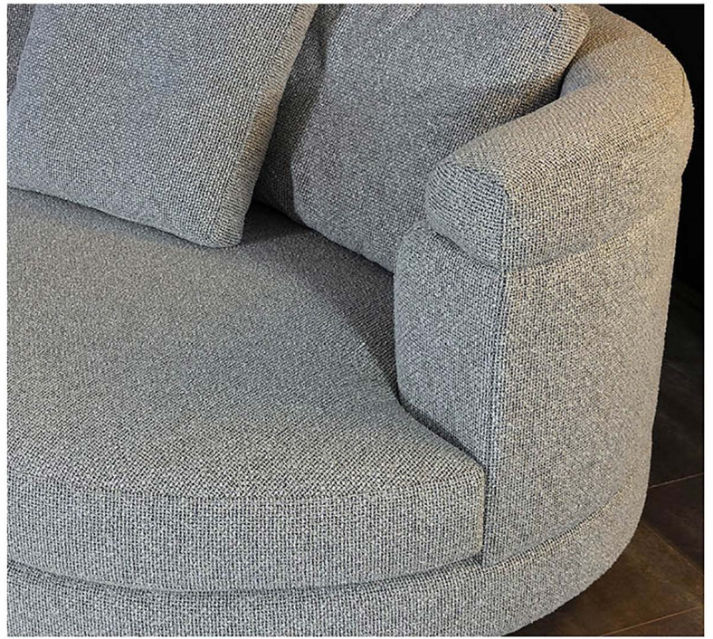
LUXURY SOFA SAGIST GROUP 15