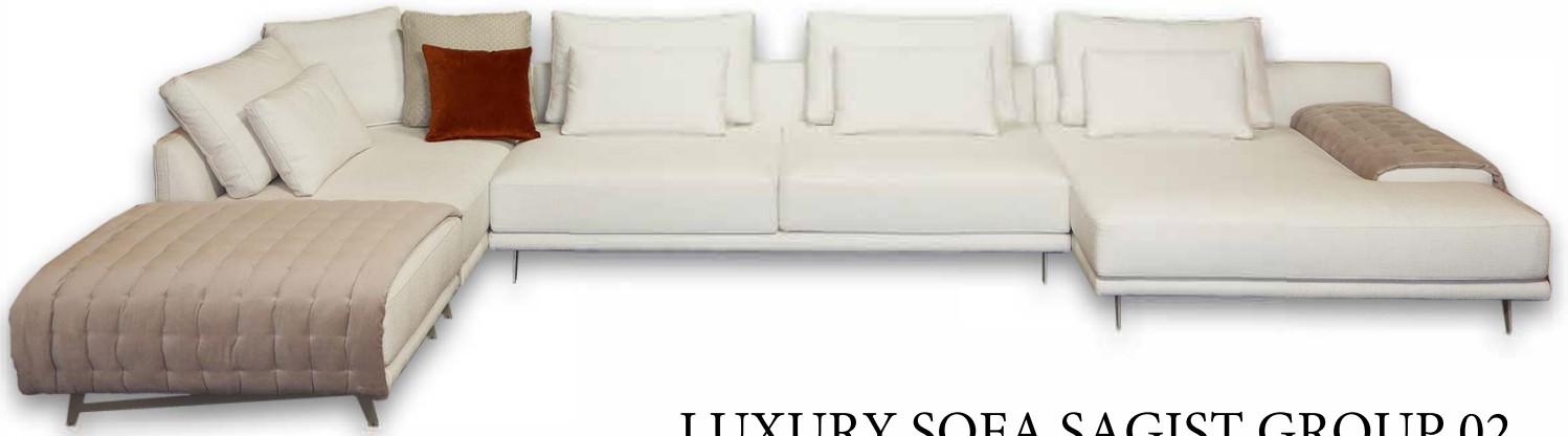
LUXURY SOFA SAGIST GROUP 02