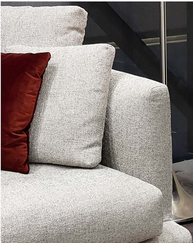
LUXURY SOFA SAGIST GROUP 10