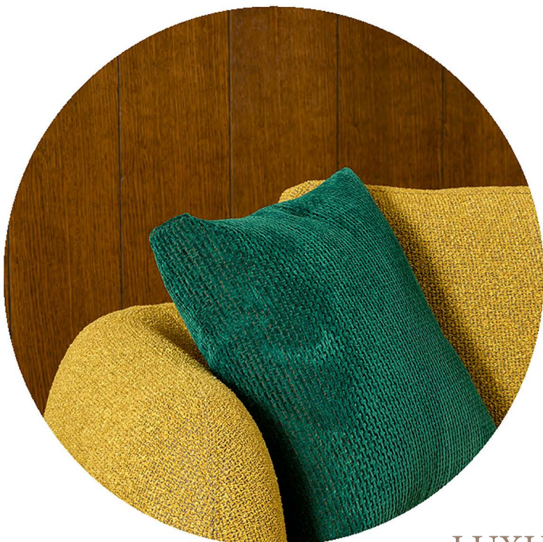
LUXURY SOFA SAGIST GROUP 14