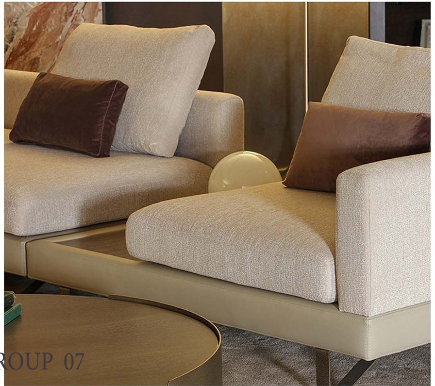
LUXURY SOFA SAGIST GROUP 07