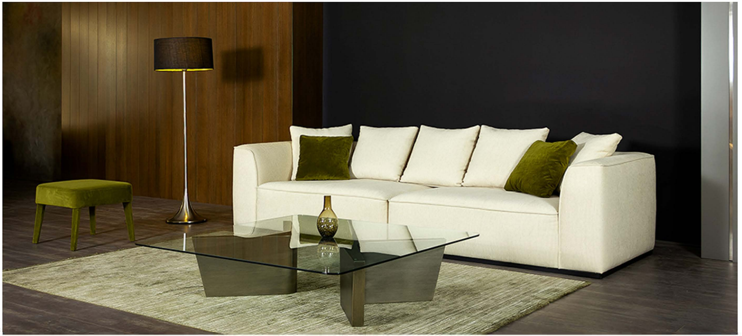
LUXURY SOFA SAGIST GROUP 17