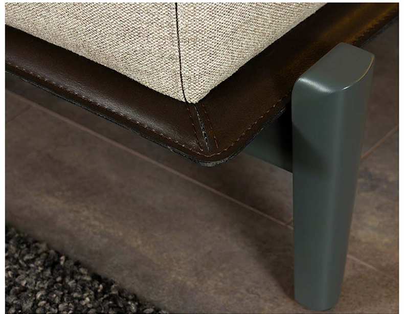
LUXURY SOFA SAGIST GROUP 13