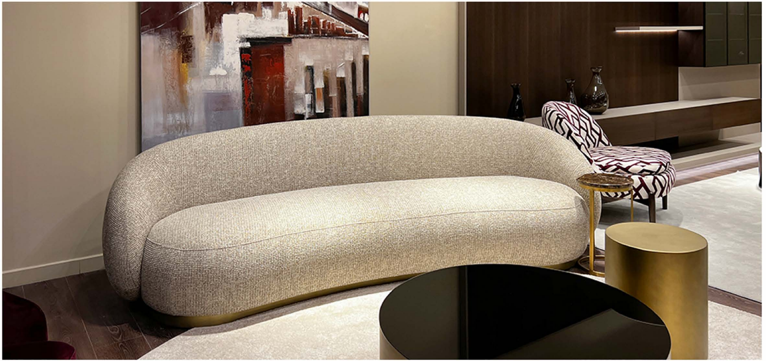
LUXURY SOFA SAGIST GROUP 09