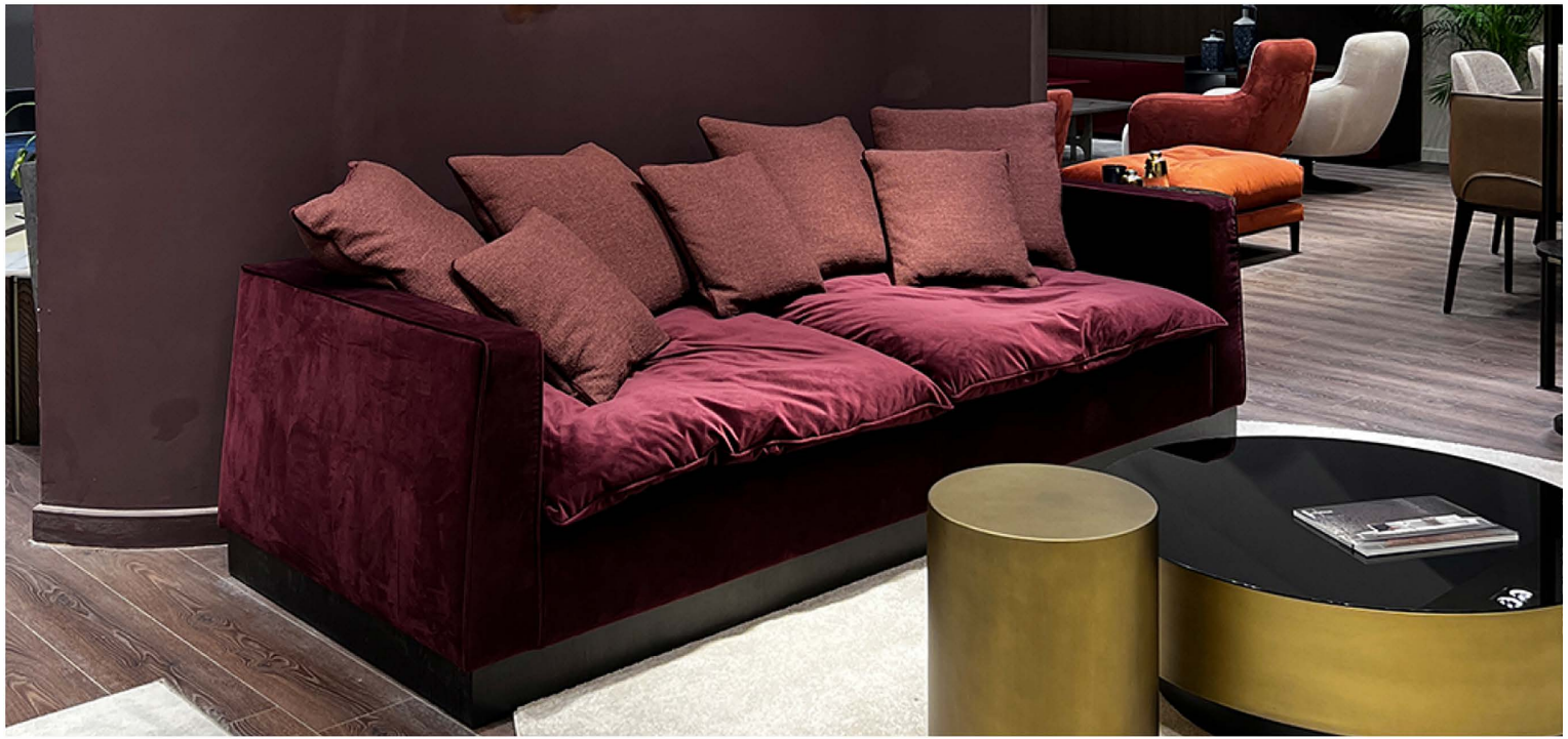
LUXURY SOFA SAGIST GROUP 11