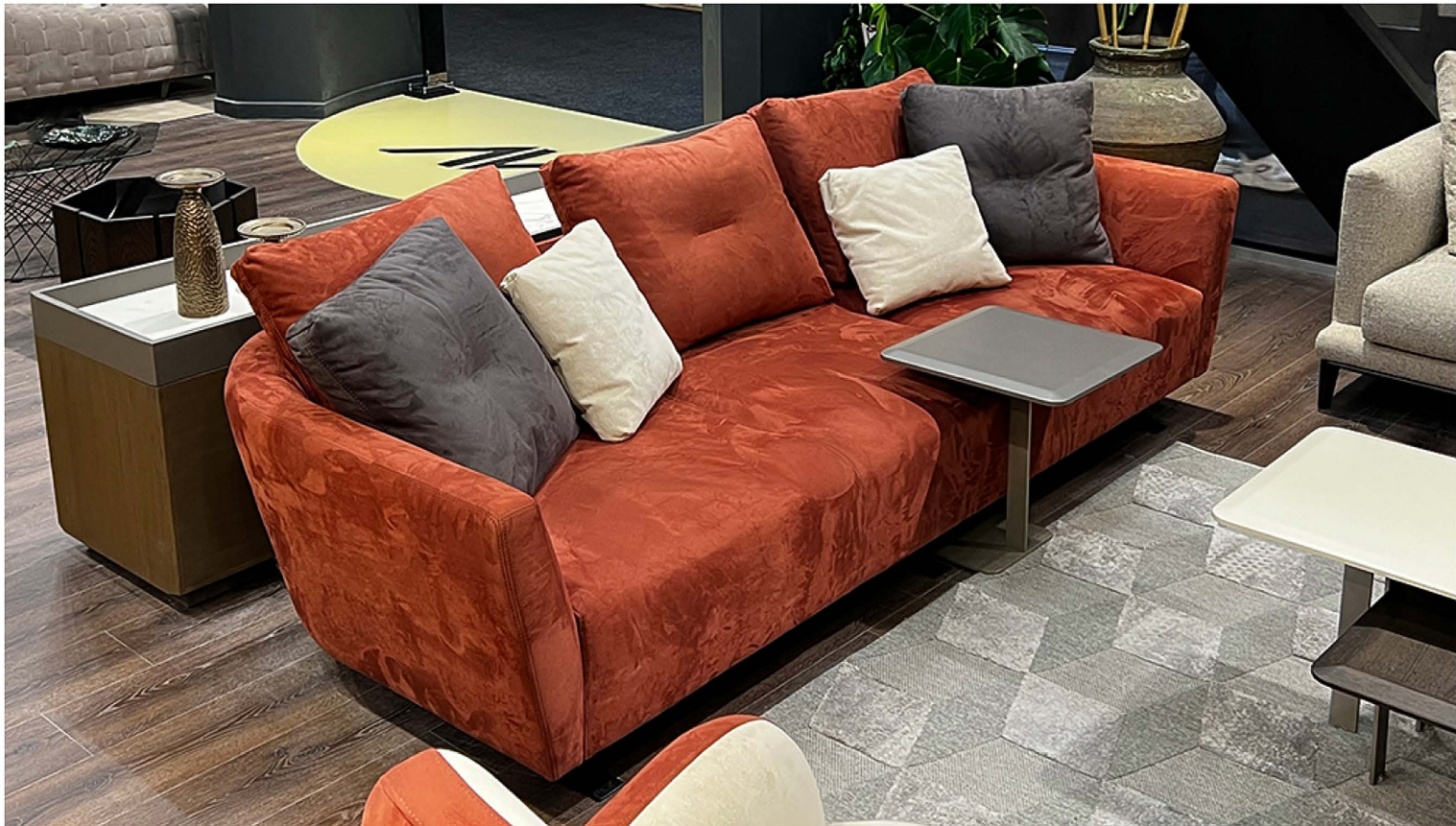
LUXURY SOFA SAGIST GROUP 12